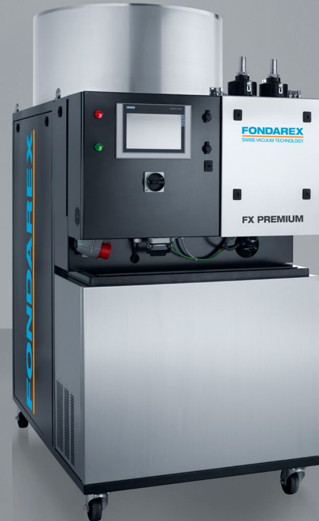
FX PREMIUM MOBILE 950